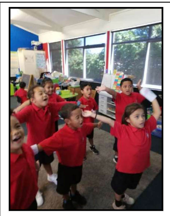
Kiwi 5 dancing to a shape song.