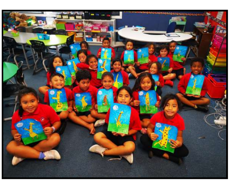
Kiwi 7 with their 'Giraffes Can't Dance' artwork and their growth mindset.