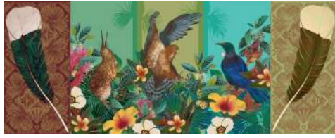
Bairds Mainfreight Primary School